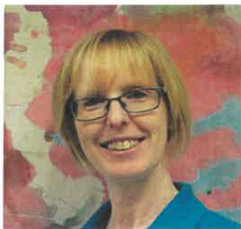
Jackie Wilson Blue/Purple Gp